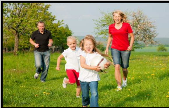
Activate your immune system