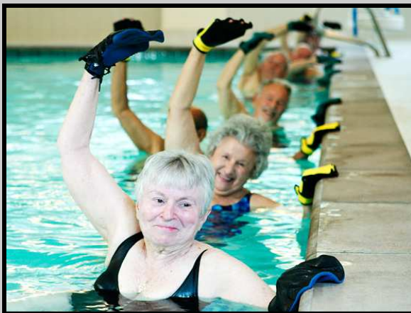
Improve bones and muscles